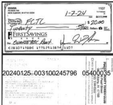
01/26/2024 Check 1107 $20.00