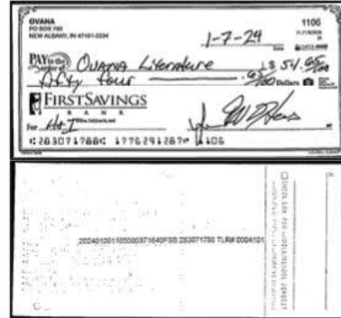
01/09/2024 Check 1106 $54.65