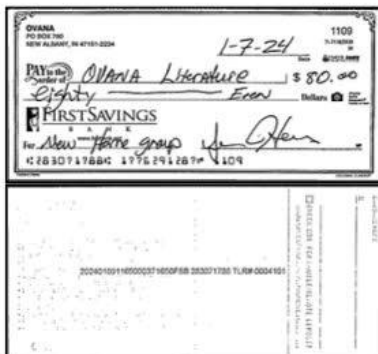
01/09/2024 Check 1109 $80.00