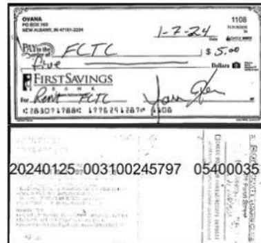
01/26/2024 Check 1108 $5.00