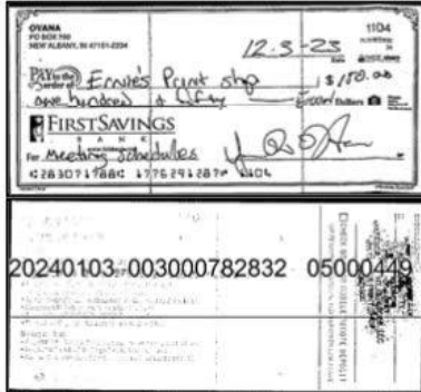
01/04/2024 Check 1104 $150.00